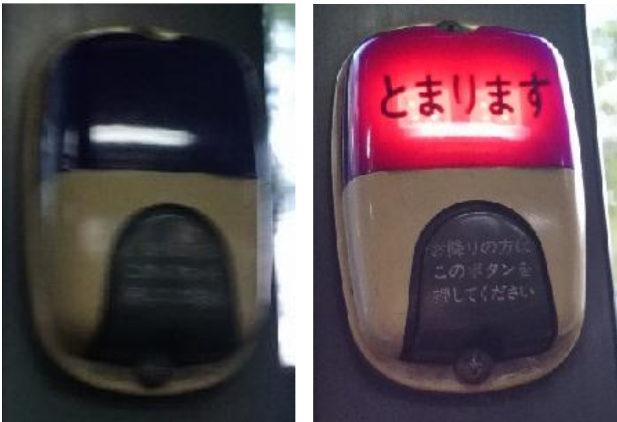
Fig.7 When you want to get off at the next bus stop , you press this button .