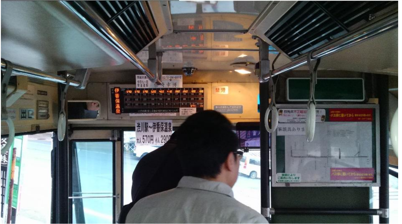
Fig.6 Electronic display in the bus The name of next bus stop and price are displayed.