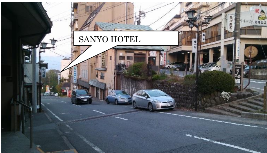
Fig.9 SANYO HOTEL direction from Ikaho bus terminal

Because the name of “Ikaho bus terminal 「伊香保バスターミナル」 ” is long, it is scrolled. When this indicated, you push the button.