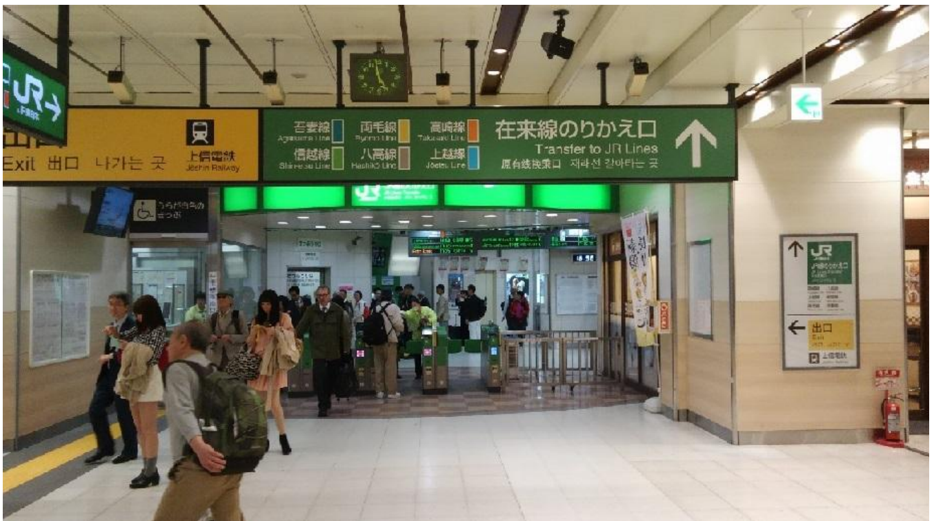
Fig.1 Transfer from shinkansen to JR lines at Takasaki stn.