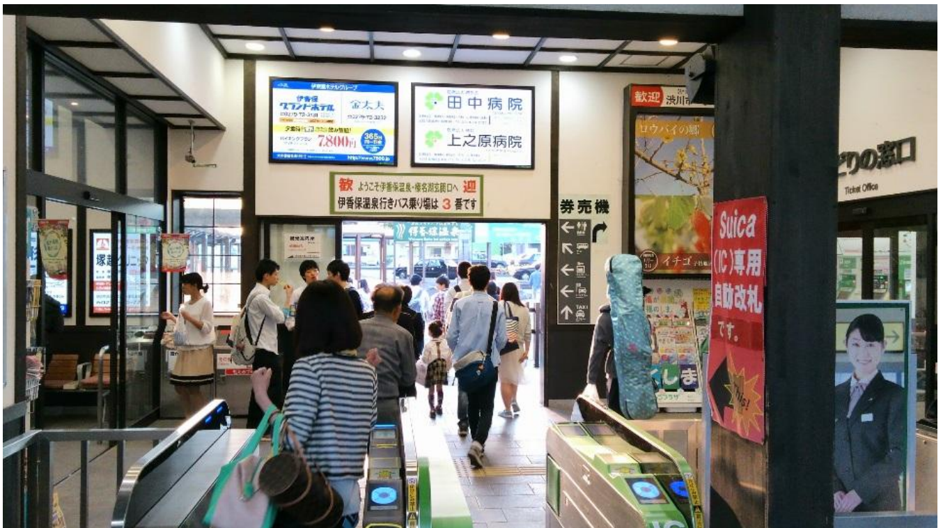
Fig.3 The ticket gates at Shibukawa stn.

There is a visitor center and a convenience store to the left direction..