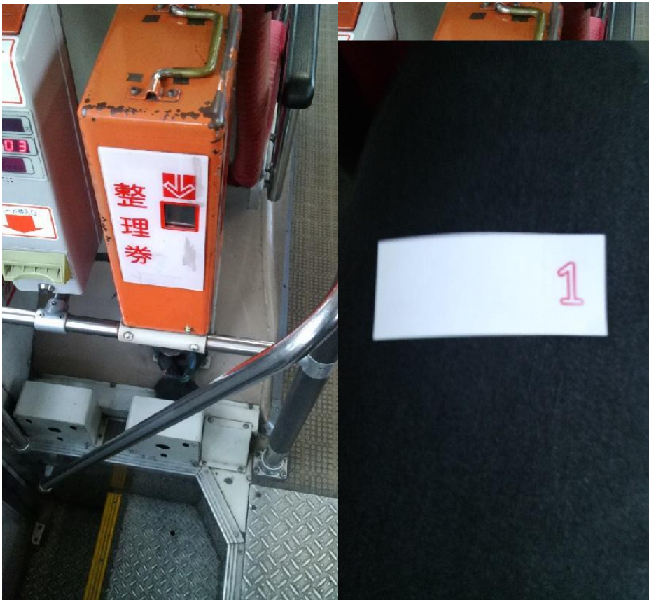
Fig.5 Take a numbered ticket

It takes about 20 minutes from Shibukawa station to “Ikaho bus terminal”.