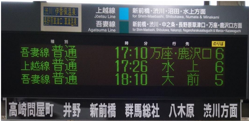
Fig2 transfer to joetsu line or agatsuma line Either OK Plathome No.5 or 6