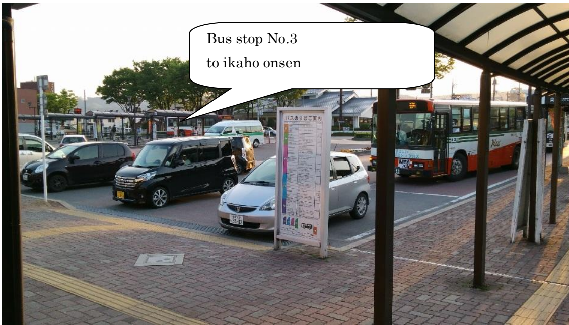
Fig.4 Bus stop No.3 at Shibukawa stn.

You must get on each of the bus from the rear-side door and get off from the front-side door, with the fare paid when you disembark.