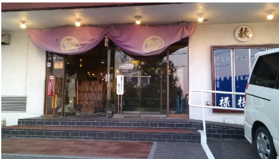
Fig.11 The entrance of SANYO Hotel.

You enter the front door, and go to the left, and go down stairs. There is the reception of ARDF.